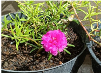
Figure 2. Purslane ( Portulaca grandiflora ) Magenta Flower Variety

Purslane herb ( Portulaca grandiflora ) extract which was formulated as an ointment test showed antibacterial activity against Staphylococcus aureus in the highest concentration (30%). This antibacterial activity may be due to the high concentration of the extract in the ointment formulation, which allowed it to diffuse well in the agar medium. The purslane herb ointment with 10% and 20% concentration of extract didn't show a clear zone. The base material that was used in the formulation may be affecting the result. This aligns with Pawar and Nabar (2010) research which showed that vaseline bases formulated herbal medicine extract didn't show antibacterial activity because of decrease in extract diffusion ability. Vaseline has the capability to bind extract, so it decreases the extract's ability to diffuse well in the agar medium. Vaseline is a hydrocarbon base that is intact to the skin in a long time and uneasy to rinse with water (Sasongko et al. , 2019).