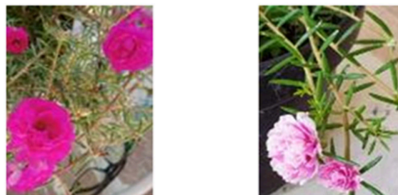
Fig. 1 The branch, leaves, and flower morphology of purslane herbs ( Portulaca grandiflora ).

a Significantly different from K(–) (negative control). b Significantly different from K(+) (positive control). c Significantly different from A10 (purslane herbs A extract 10% concentration). d Significantly different from A20 (purslane herbs A extract 20% concentration). e Significantly different from C10 (purslane herbs C extract 10% concentration). f Significantly different from C20 (purslane herbs C extract 20% concentration).