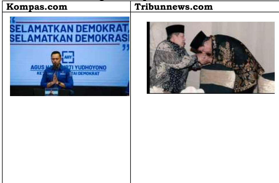
Table 11. Visual Images Kompas.com dan Tribunnews.com

Related to the protrusion of events (explication) as shown in Table 8, kompas.com and tribunnews.com seem to be inclined to package KLB as a party problem that leads to an internal power struggle. From the choice of words or sentences, kompas.com seems to direct readers' perceptions to internal problems, through highlighting the fact that there are party leaders who are persuaded by other party officials from different camps. Likewise, tribunnews.com presents the fact that there is a mass struggle within the internal body of the Democratic Party. This fact is further strengthened by the choice of the word "dualism" to direct readers to the context of internal problems that occur within the Democratic Party.