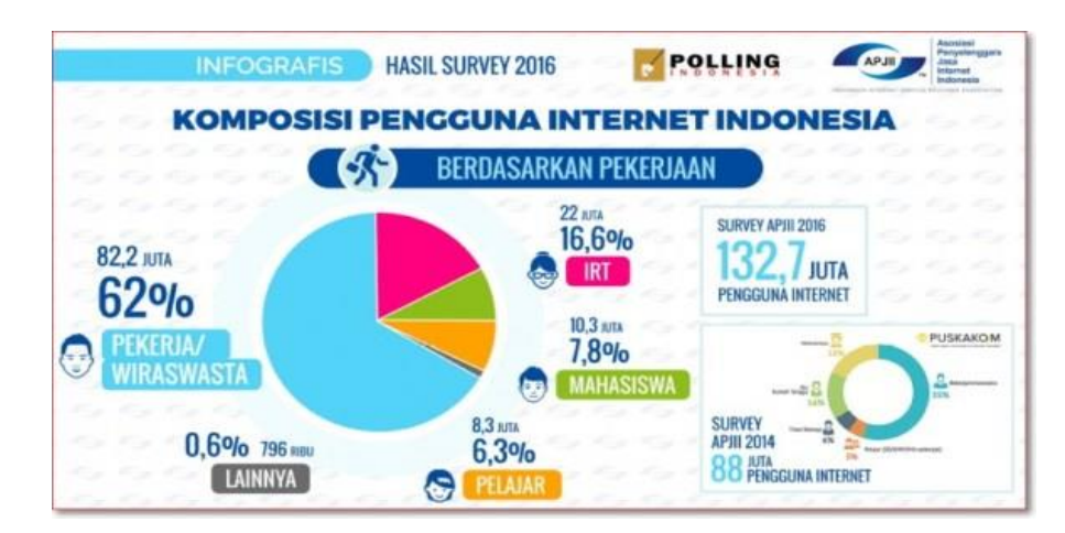
Picture 1.4. Occupation of Internet Usage Source: Indonesian Internet Service Providers Association, 2016

The largest number of people who used Internet is people who work, which still work in other people's company or open their own business. They used it for analyze the markets to see and analyze the potential customers is in where.