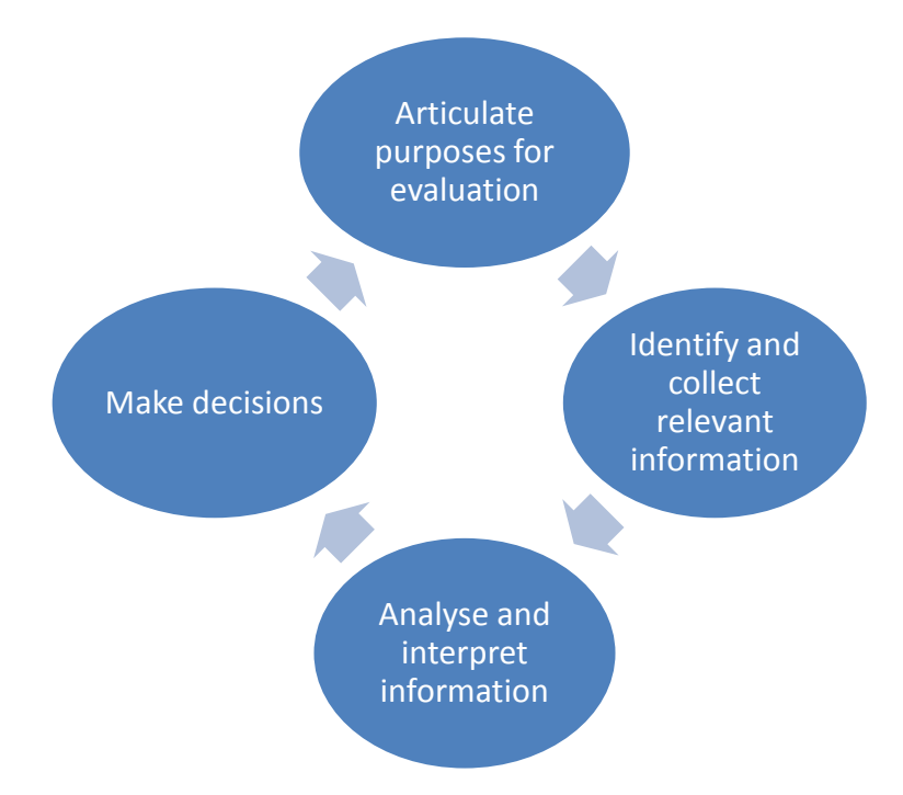
Figure 2.1 Four Basic Components of Evaluation Figure 2.1 depicts these components in a cyclical relationship because they are related into one another and ongoing: each component affects the next continuously.