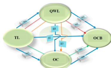
Fig. 1. Research model.

In Table 2 and it can be seen that the full-time (permanent) teachers who were respondents in this study were 83 people (50.30%) aged between 41 and 50 years; a total of 44 people (26.67%) were between the ages of 60 years; as many as 30 people (18.18%) aged between 31 and 40 years, and as many as eight people (4.85%) aged between 25 years and 30 years. Table 2 shows that 100 permanent teachers who were respondents (60.60%) were female, and as many as 65 people (39.40%) were male. Table 2 shows that 156