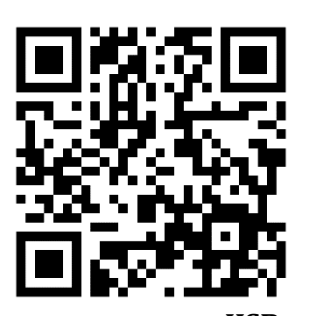
IJSB Accepted 17 April 2022 Published 22 April 2022 DOI: 10.5281/zenodo.6477910

The dynamics of business competition is increasing in its intensity and aggressiveness. This requires businesses to focus on effective strategies to maintain and achieve their goals. E-commerce has forced businesses to expand their ability and also their performance in this current era. For clothing online business, especially in east Java, the effort is tremendous due to the dynamic of changing market and consumer preferences. This industry is expected to achieve and improve its performance, with various capabilities and strategies. The purpose of this research is to determine the effect of Internal Environment, Knowledge Management, Dynamic Capability, to E-Business Performance through Innovation Capability. This research uses 210 clothing online business as samples with random sampling method. Method of hypothesis testing uses structural equation model to test 10 hypotheses in this research. The result shows that Internal Environment, Knowledge Management, Dynamic Capability has significant influence on Innovation Capability. In addition, only Internal Environment, and Dynamic Capability significantly influence E-Busines performance, while Knowledge Management does not significantly influence E-Business Performance. Furthermore, Innovation Capability is found as intervening variable of relationship between Internal Environment, Knowledge Management, and Dynamic Capability to E-Business Performance.