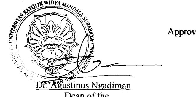
Dean of the Teacher Training Faculty