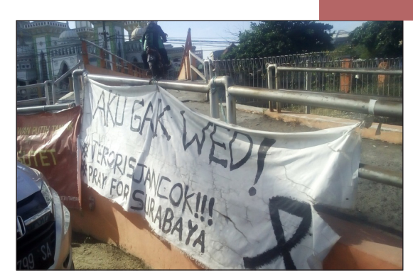
Figure I.Banner in Jalan Kalisari, Surabaya after Surabaya Bomb Blast

On Sunday night, the community of young people held an act of sympathy and solidarity. 1000 candles were around Hero Monument (Tugu Pahlawan). This action denounced acts of terrorism which damaged true brotherhood. This action also echoed the call for Surabaya Wani or Brave Surabaya. This action was also followed on social media networks and continued with the installation of various forms of banners or billboards in almost every corner of the city of Surabaya. It read Surabaya Wani or Terorisme Jancuk. Most of these banners were used banners where statements were manually written and sprayed with paint. These banners could be found on several highways including Governor Suryo Street, Panglima Jenderal Sudirman Street and Ir. Soekarno Street. One of Surabaya Bonek leaders stated that after the suicide bombing there was an appeal through the Arek Bonek Whatsapp group in 1927 to install the banners. They agreed on two hash tags namely #SurabayaWani and #KamiTidakTakut (translation: We are not afraid). In the field implementation, there were various expressions of anger from the Bonek members indicating solidarity to the bombing incident. One of them