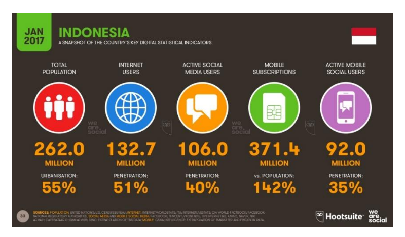
Figure 1.1 User Composition of Internet User in Indonesia

The development internet in the world also related to the gadget especially mobile phones. According to data, we can look that 93 percent of all internet users now go online via mobile devices (phones or tablets), and with the majority of new internet users now 'phone first', mobile's share is likely to increase even more over the coming months (Hootsuite, 2017). If we look at the Kominfo (Kementerian Komunikasi dan Informatika) data, the internet users reached 143.26 million of 262 million total population in Indonesia (Kominfo, 2017). This statement give result that online business is a fresh market in this era. The opportunity of online business is one of the strong reason many product/services start run their business in this platform. Now, we can look many application launched, online shop in social media like Facebook, Instagram, and also they who join in big online shop company, instance Tokopedia and OLX.